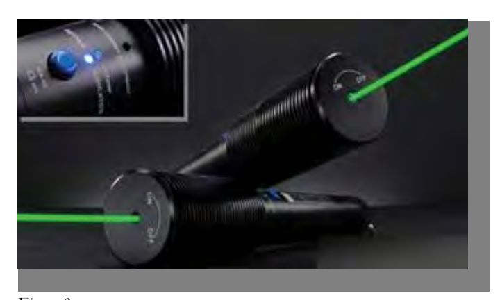
Figure 3: Example of a Powerful, Handheld Laser Device Available On-line

The latest reports indicate that aircraft illuminations by handheld lasers are primarily green (91%) in color, as opposed to red (6.3%), which was more common a few years ago. This is significant because the wavelength of most green lasers (532 nm) is close to the eye's peak sensitivity when they are dark-adapted. A green laser may appear as much as 35 times brighter than a red laser of equal power output. Due to this heightened visibility and increased likelihood of adverse visual effects, illumination by green lasers may result in more events being reported.